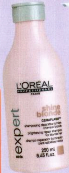
L'Oréal Professionnel Serie Expert Shine Blonde Shampoo, $19.15 This shampoo for blondes contains Ceraflash, a unique triple-action technology that will neutralise unwanted yellow tones and give long-lasting colour protection. It'll also add a brilliant shine to the hair.