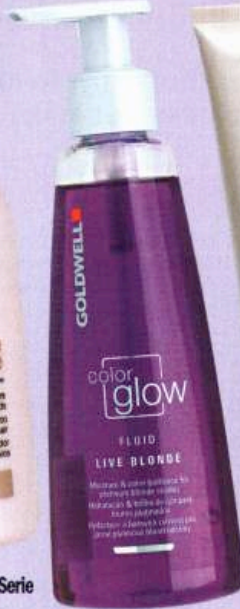
Goldwell Color Glow Live Blonde Leave-in Fluid, $22.50 Tones and perfects grey hair. The colour enhancers add colour brilliance, while the lightweight, leave-in formula provides moisture and natural volume. Suitable for daily use.