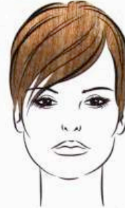
Beige Cashmere The lightest shade available in the range. It suits women with natural blonde hair.

SHADES AVAILABLE IN L'ORÉAL PROFESSIONNEL'S COLOR SUPREME RANGE