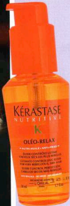
Kerastase Nutritive Oleo-Relax Elixir, $35.50 This luxurious serum controls very dry, very rebellious and extremely difficult-to-control hair.