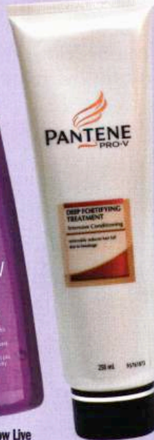
Pantene Pro-V Deep Fortifying Treatment, $6.99 This effective treatment product nourishes each strand of hair to the core as well as strengthening the hair surface and cuticle.