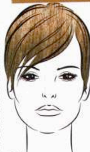
Champagne Diamond This soft gold enhances the complexion. It has a blonde-based grey tone that suits most women.