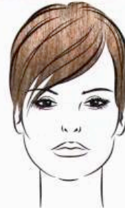
Mysterious Pearl If you are almost grey all over, this flattering iridescent cool beige shade is perfect for you as you take the final steps.