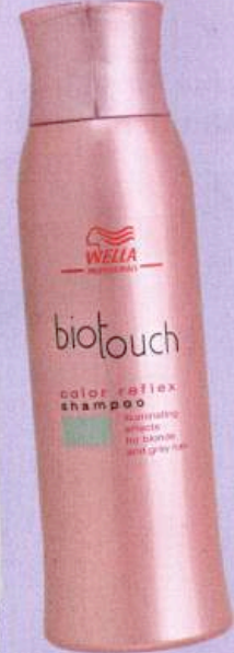
Wella Professional BioTouch Colour Reflex Shampoo for Blonde and Grey Hair, $22.50 This shampoo contains mallow extract to gently cleanse away yellow tones, leaving a lustrous, silvery shine - perfect for platinum blonde or grey hair.

you can do to better condition your grey hair will help. Conditioning can make hair retain more moisture and therefore make it more flexible, which is beneficial if hair tends to be wiry.